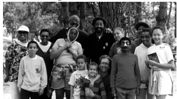
Second Saturday School's Natural Bridges Fieldtrip - Apr 1997